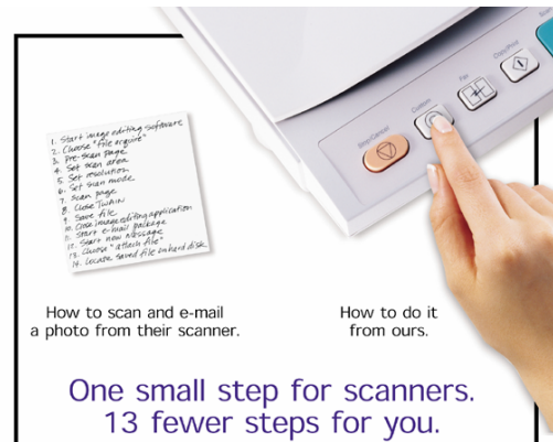
1998 Visioneer OneTouch Ad

In 1998, Visioneer changed the way that users interacted with their scanners. Previously there were multiple steps to scan a document or photo. Launching software, setting resolution, paper size, prescan, color depth, cropping, saving, etc. And the average user who was not skilled in scanner or imaging technology had no idea how or why to make these choices. So any scanning task took up to 14 steps and some techno-savvy. Enter Visioneer OneTouch . Visioneer created buttons on scanners that let the user scan with one touch to already configured settings for different applications: scan a photo, scan to email, scan to the printer (copying), etc. Before you knew it, everyone starting putting buttons on scanners. Why? Because ease of use was more important than any other feature including price. The steak is more important than the sizzle.